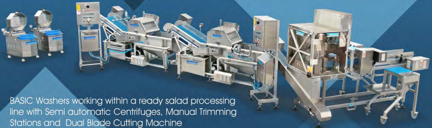
BASIC Washers working within a ready salad processing line with Semi automatic Centrifuges, Manual Trimming Stations and Dual Blade Cutting Machine

NOTE: machine images appearing in the present folder are indicative only and could differ from the last model in production.