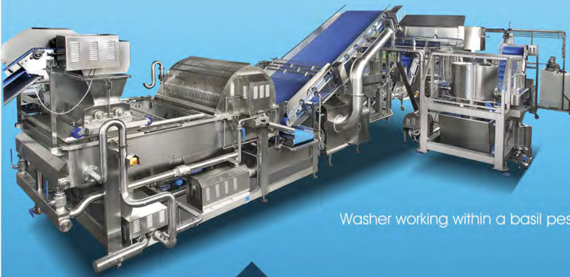
Washer working within a basil pesto production line