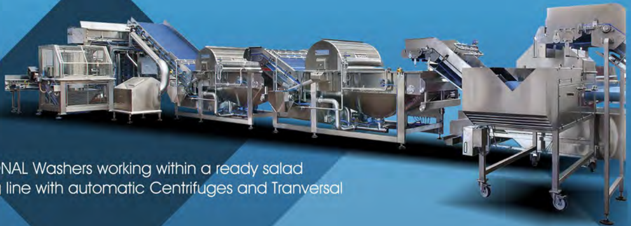
FULL OPTIONAL Washers working within a ready salad processing line with automatic Centrifuges and Transversal Slicer